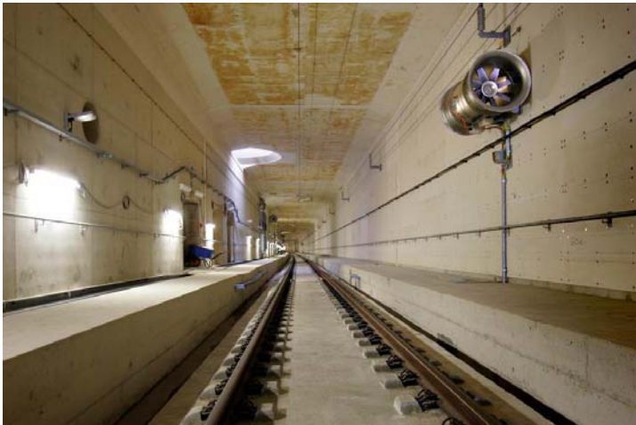
oktober 2005