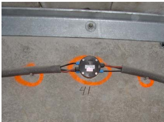
IS-Liquid Leveling Sensor