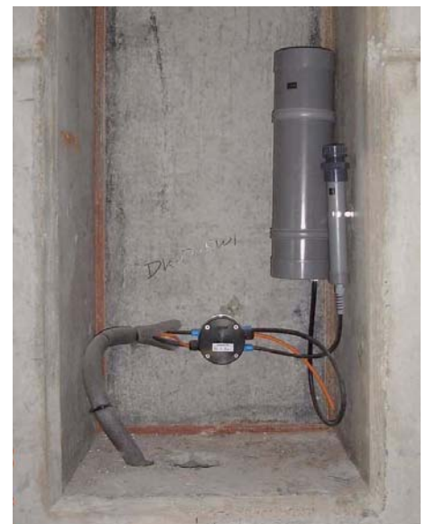
IS-Liquid Leveling Reference Sensor incl. liquid reservoir and air dehumidifier